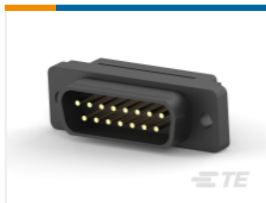
TE Part # CAT-AM7-H3 IDC D-Sub: Plug Assembly, Low Profile, Signal, 2.77 mm