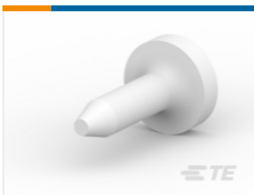
TE Part # 206509-1 SIZE 20 KEYING PLUG